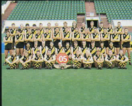
Richmond Football Team