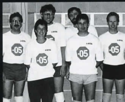
RTA Volley Ball Team

M any of you will know or have had first hand experience of the results of road crashes in which drivers of vehicles had been drinking.