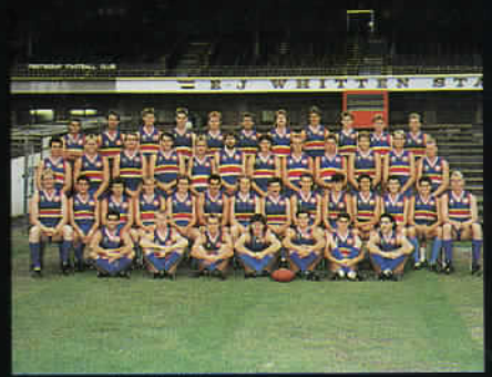
Footscray Football Team