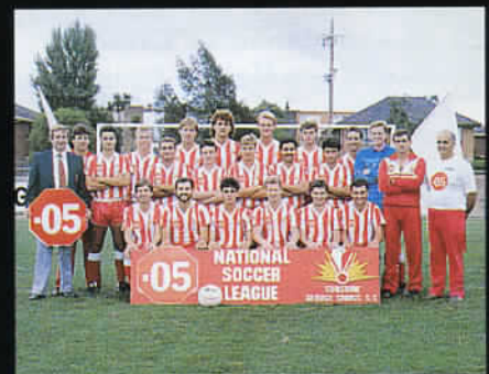
Sunshine George Cross Soccer Team