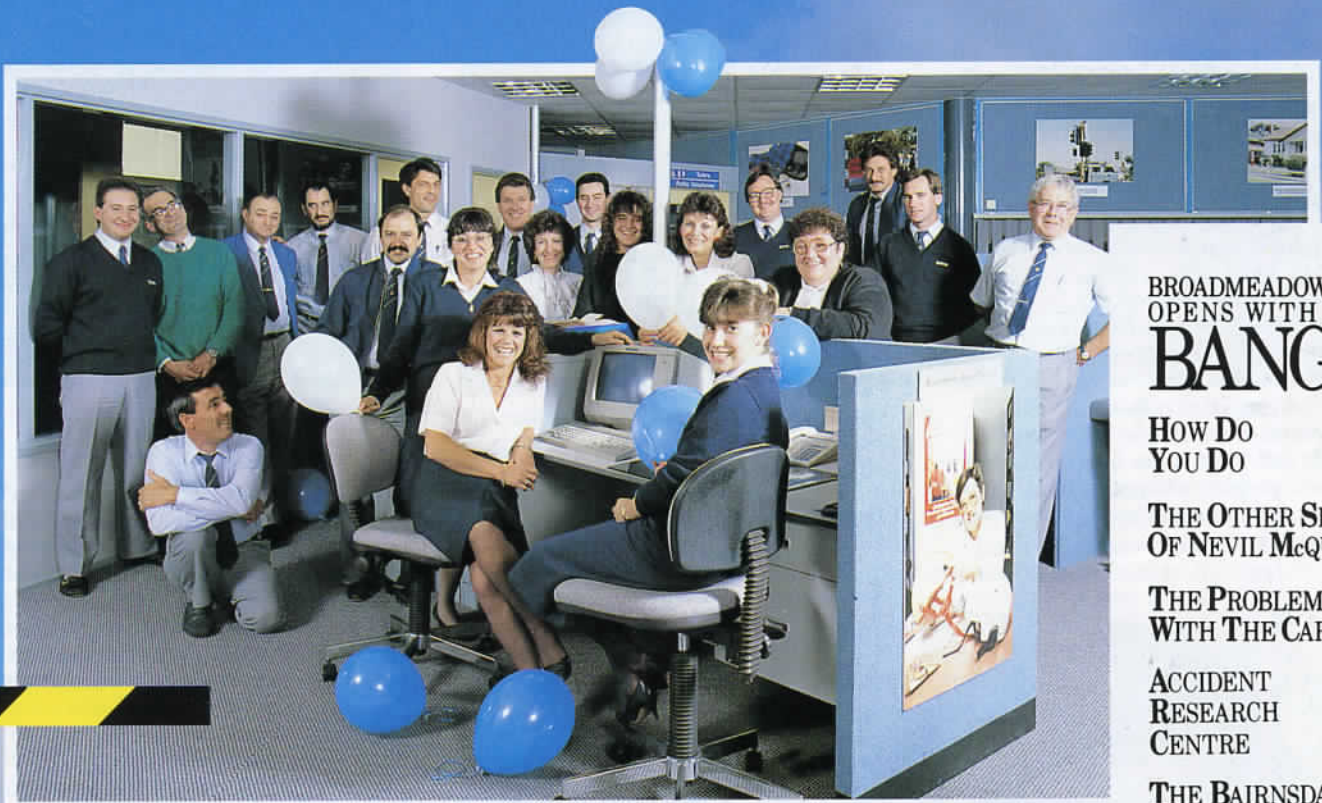
The Broadmeadows District Office Staff