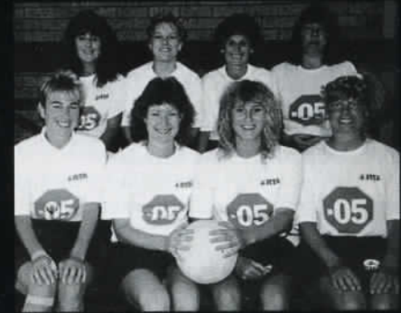
RTA Netball Team