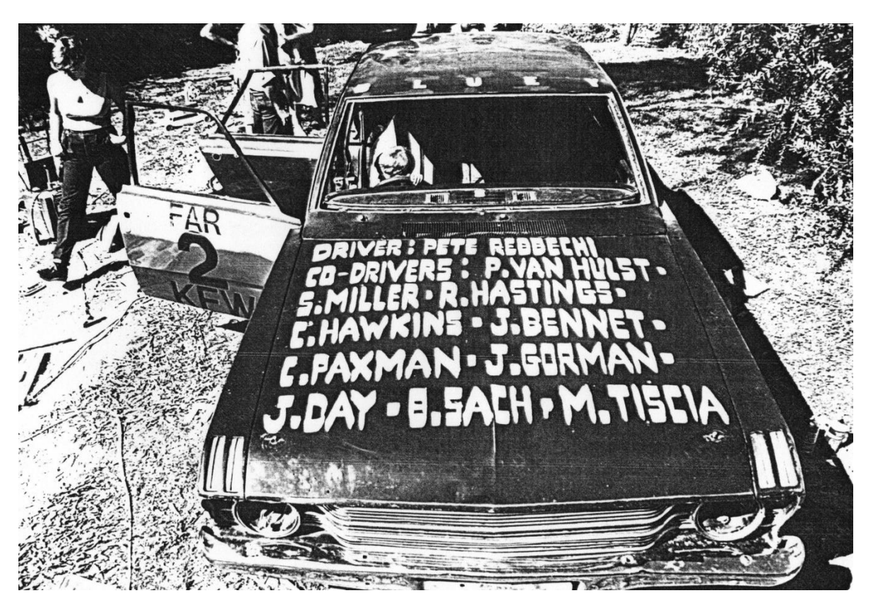
1985 – An old valiant the younger employees did up for a derby