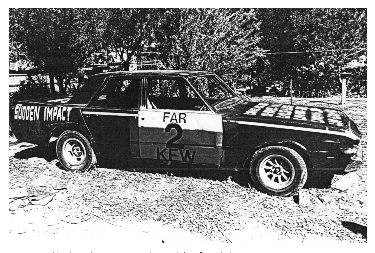
1985 – An old valiant the younger employees did up for a derby