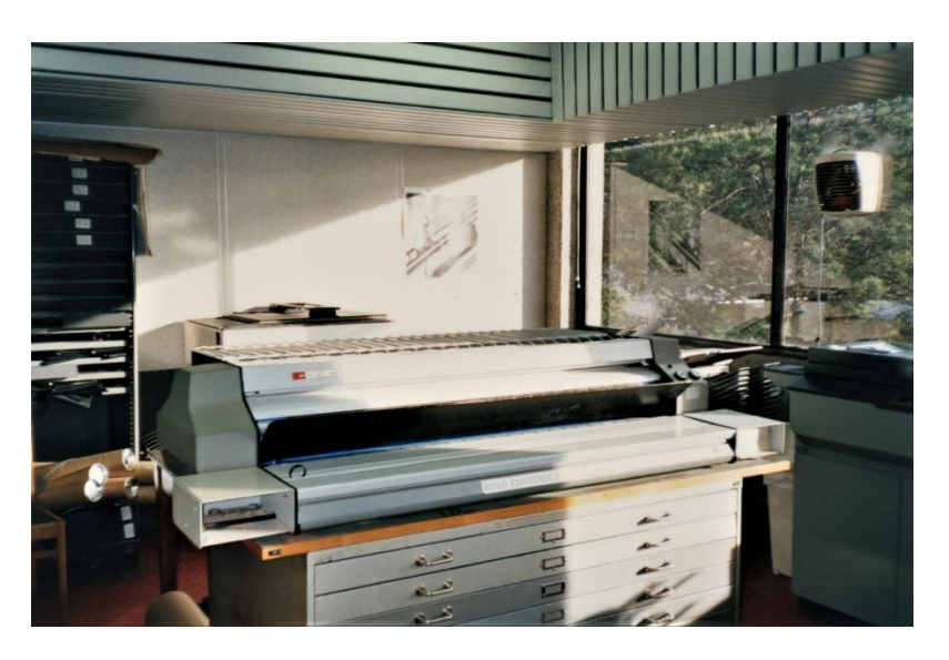
1985 – Print room at Bridge division. Includes dyeline printer for all the plans.