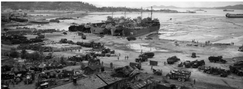
Invasion of Inchon – September 1950

The Vietnam War started as a civil war between North Korea and South Korea in 1950. At the end of the Second World War, Soviet forces accepted the surrender of Japanese forces north of latitude 38° N (known as the 38 th parallel) and the U.S.A. forces accepted Japanese surrender south of it. Negotiations failed to reunify the two halves, the northern half being supported by the Soviet Union and the southern half being backed by the U.S. In 1950 North Korea invaded South Korea, and U.S. President Harry Truman ordered troops in to assist South Korea. The UN Security Council, minus the absent Soviet delegate, passed a resolution calling for the assistance of all UN members in halting the North Koreans. At first North Korean troops drove the South Korean and U.S. forces down to the southern tip of the Korean peninsula, but a successful amphibious landing at Inchon, turned the tide in favour of the UN forces. They pushed the North Koreans back up the Korean Peninsula to the Yalu River on the Chinese border.