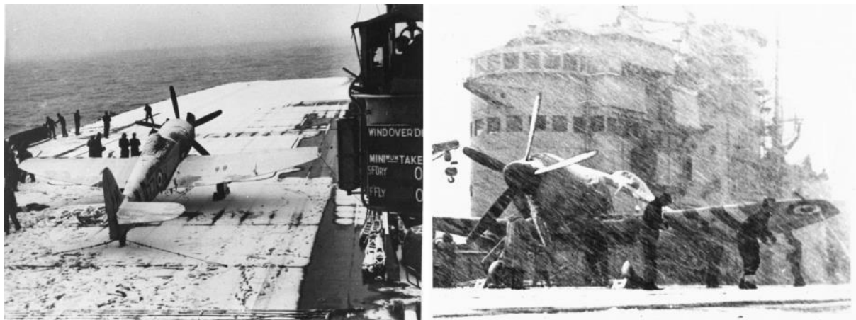
Sydney's crew was not prepared for the intensity of Korean winters.

In November 1951, snow and high winds prevented the resumption of flying operations and in the succeeding days of the patrol there was limited activity.