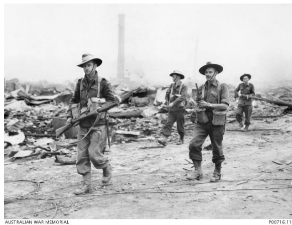
Australian troops move through the wreckage of a North Korean town.

From 1950-53, 17,000 Australians in all defence forces fought as part of the United Nations (UN) multinational force. After the war ended, Australians remained in Korea for four years as military observers. Since then, Australia has maintained a presence, discharged by the Australian Military Attaché.