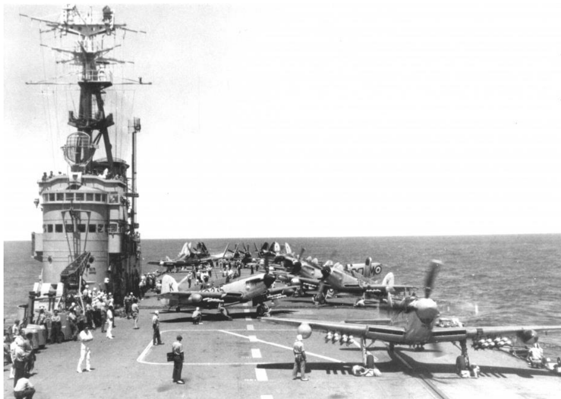
Fireflies are readied for launch from Sydney 's flight deck – 1951.

Sydney began her first patrol of the Korean War on 4 October in the western theatre, transferring four days later to the east coast for special operations. On 11 October, operating against troop concentrations and suspected store dumps on the east coast, Sydney created a light fleet carrier record by flying 89 sorties, making a total of 147 sorties in two days of operations.