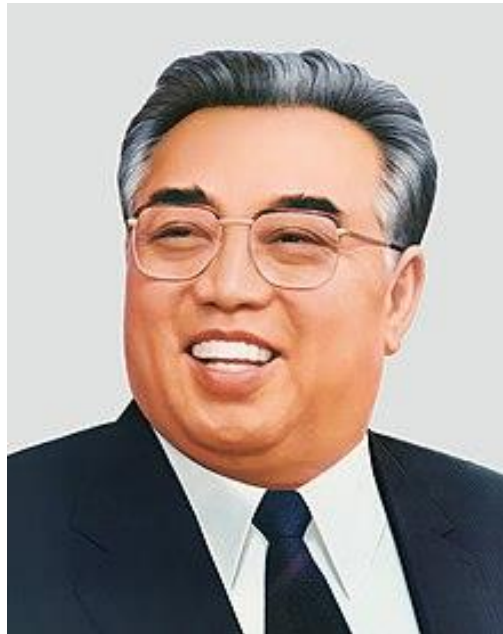
Official portrait of Kim Il Sung, often seen in public places.

Neither side 'won' the Korean War but South Korea was saved from the yoke of communism. It is now a successful and prosperous nation. Officially the war has not ended although shots haven't been fired for 70 years. It is a ceasefire that hasn't been followed by a peace treaty. It has also left North Korea as one of the poorest nations on earth – under the oppression of totalitarianism more than communism. Kim Il-sung was the Commander of the North Korean forces during the war and ruled the country until his death in 1994. His son, Kim Jong-il, succeeded him, and he in turn was succeeded by his son, Kim Jong-un.