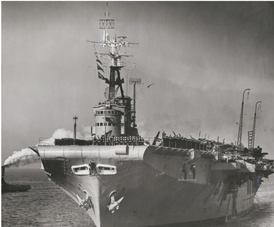
HMAS Sydney berthing at Station Pier, Port Melbourne, following active service in Korea.

Operations continued until 25 January 1952, Sydney's last day of participation in the Korean War. During the period of 17 to 25 January a total of 293 sorties were flown including one day on convoy escort and two days when weather conditions prevented flying. Sasebo (in Japan) was reached on 26 January and the following day, screened by the destroyer HMAS Tobruk , the ship sailed for Australia.