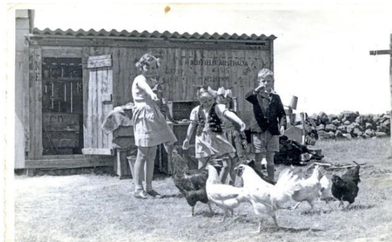
Nuffield Tractor Crate ends up a shed

He then started to build a house with the help of his neighbours, that's what they all did for each other. He lived first in a wooden crate that had been used to import either a car or tractor. Keilor and Sunshine Councils had allowed migrants to do this and then to occupy partly completed houses while they built the remainder. So, we arrived from Mildura to what was known at the time as a "Bungalow". My mother nearly died, the 6 of us were moving into a two room "Bungalow".