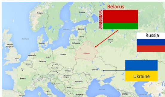
Belarus land-locked in Eastern Europe

My ancestors back to at least the 18 th Century lived in the region where Belarus is today. Prior to that I may have had Swedish ancestors because in the 18 th , 14 th and 9 th Centuries the Swedes invaded that region. In Slavic languages, my surname “Szwed” means “the Swedish man”. Watch out for the Viking in me.