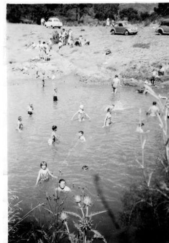
Maribyrnong River on a hot day in the 1950s

During my childhood, St Albans was like a small country town, surrounded by endless paddocks which we explored. The Maribyrnong River was nearby and a great place to play in on hot days. We didn't really feel like we were part of urban Melbourne and we all seemed to know each other. Most of us had no extended family and so the neighbours and friends of our parents became our aunts and uncles. Our "relatives" came from many different countries, so we grew up with diversity and inclusion as a natural part of life. Seventy years later we still hold annual reunions with the kids who went to school in St Albans in the 1950s and 60s.