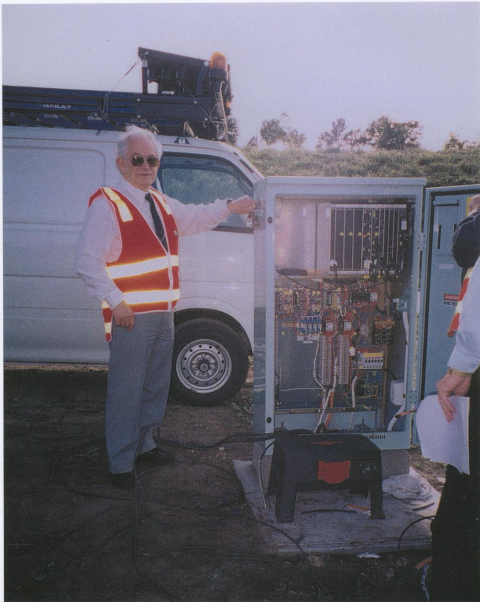
Trial switch-on of the new 'Easy Merge-Safer Flow' signals at Bulleen - (18/6/02)