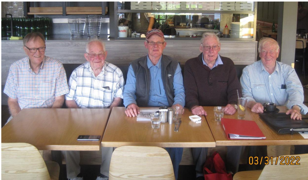
Some more people Bill worked with.