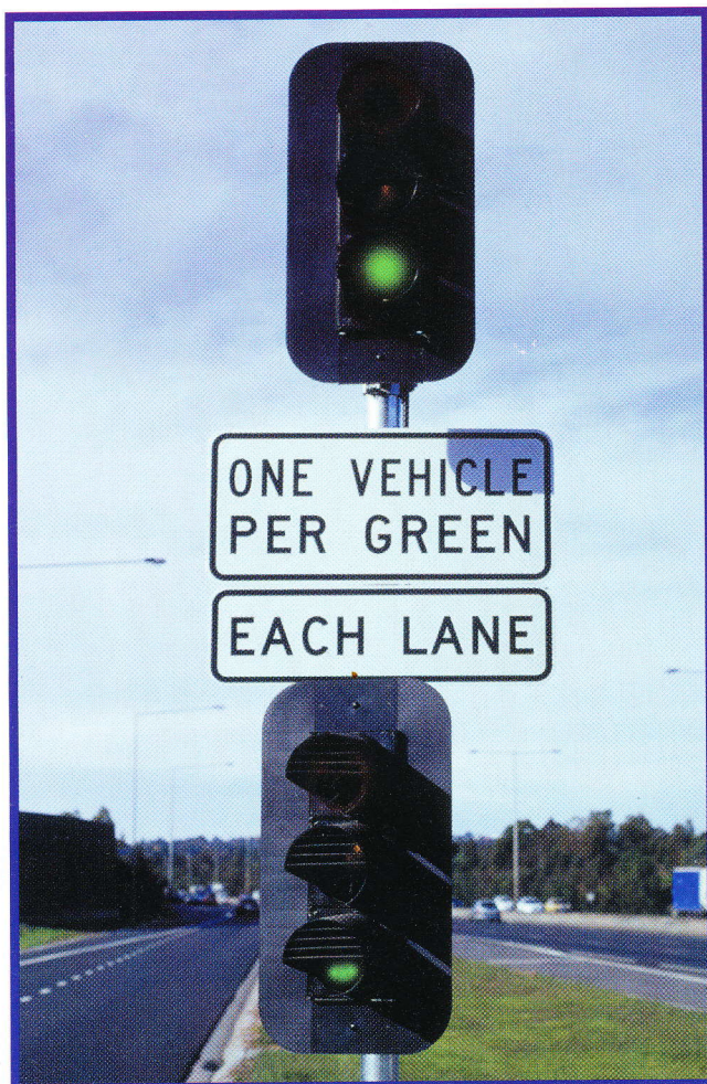
The Easy Merge-Safer Flow traffic lights

If the traffic lights are switched on, electronic message signs along the freeway entrance will advise you to 'prepare to stop'.