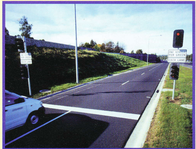
When the Easy Merge-Safer Flow traffic lights are red, stop at the white line

Regional Manager VicRoads Metropolitan South East Region Private Bag 4 Mount Waverley VIC 3149