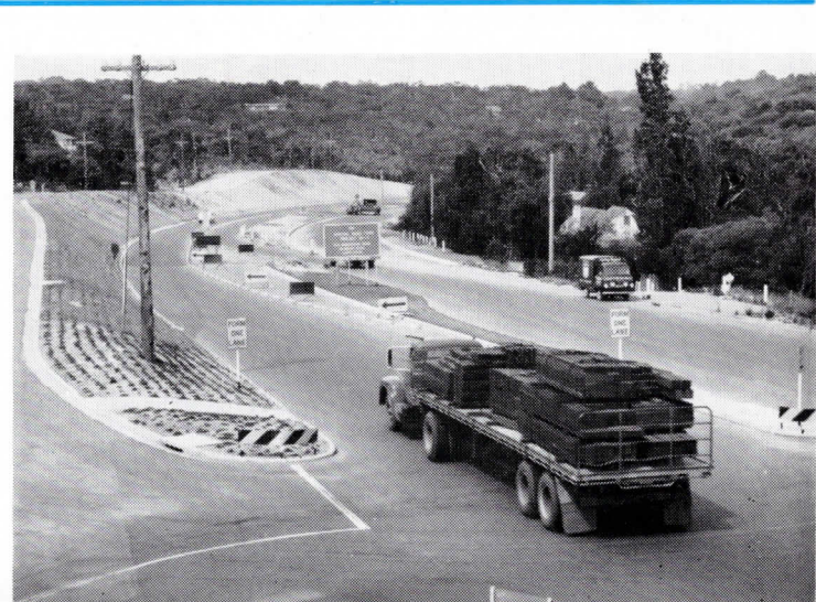
Nepean Highway south of Frankston. Duplication of pavement.