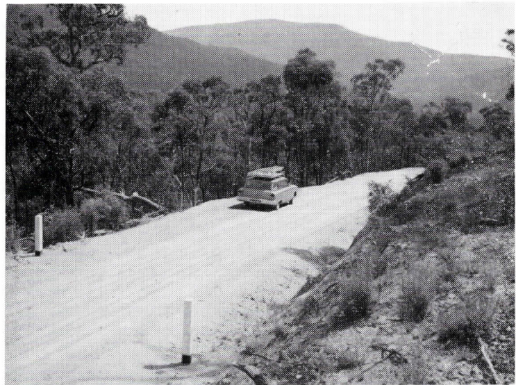
Bogong High Plains Road — West of Glen Valley.

• The new bridge over the Yarra River between the Cities of Kew and Camberwell and the City of Heidelberg has been completed and is now open to traffic.