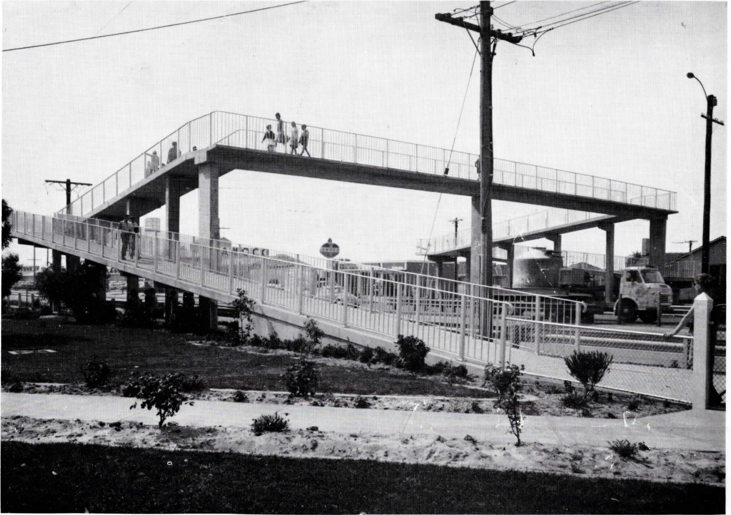
Latest photograph of crossing over the Western Highway near the Braybrook State School.

Under a scheme sponsored by the Government, construction has commenced on a series of overhead crossings over State highways in the metropolitan area to enable school children to cross in safety.