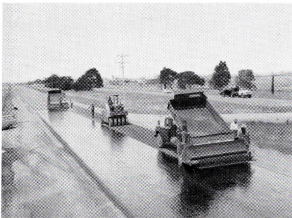
Western Highway. Sealing duplicated pavement near Deer Park.

• Major reconstruction is in progress 4 to 8 miles south of Omeo where the early stages of road construction in mountainous country may be observed. Cuts and fills up to 70 feet deep are being constructed at a cost of $250,000, but the work is clear of the existing road and will not affect travellers.