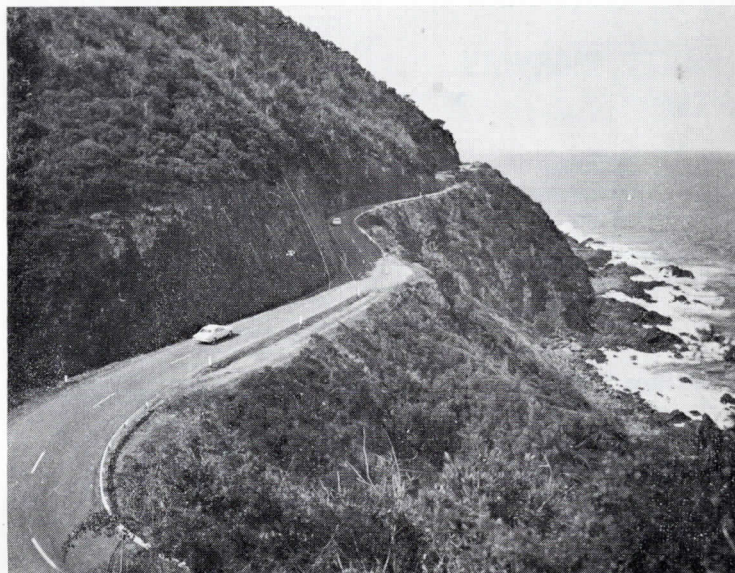
A section of the Ocean Road in Otway Shire.