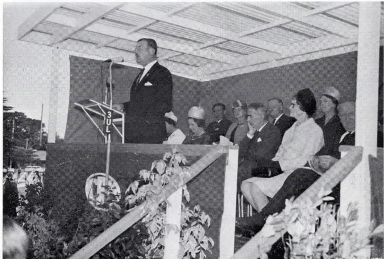
The Minister of Public Works addresses the gathering.

Total length of the bridge is 2,100 feet consisting of a central 200 feet navigation span flanked by 150 feet anchor spans and 100 feet approach spans on each side. Width between kerbs is 28 feet, and a footway 5 feet wide is provided on the south side. Navigational clearance height at high tide is 40 feet. The bridge contractor was John Holland and Company Pty. Ltd.