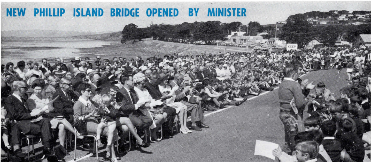
Guests assembled in front of dais.