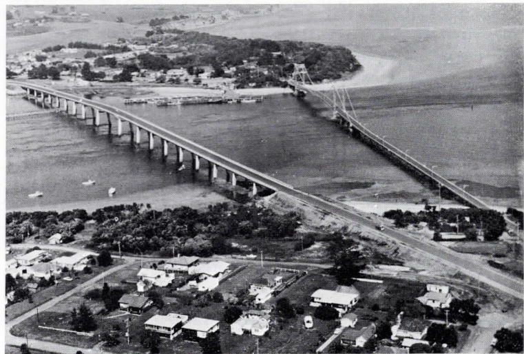
Aerial view of the new Phillip Island bridge.