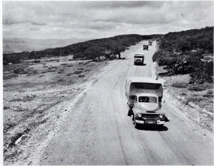
A section of the Jamieson-Licola road.

When the winter of 1969 forced cessation of construction activities the road had been completed except for the erection of road signs, erosion control and other minor works. In the spring of 1969 the Board was able to complete the outstanding work and open the link road to traffic.