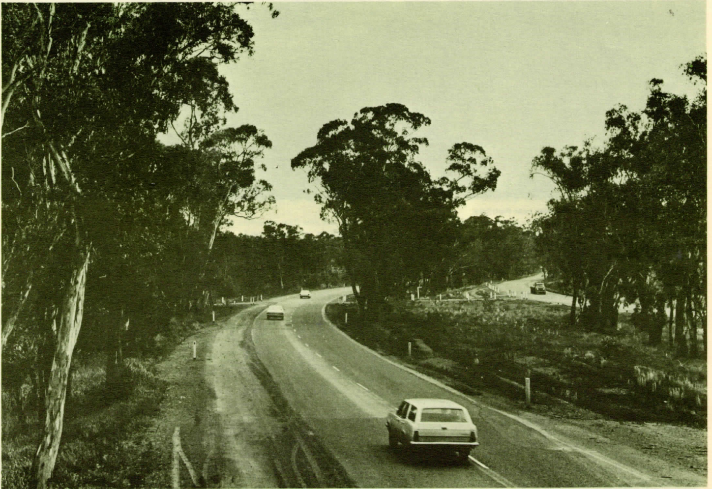
Designed to take advantage of fine stands of natural timber, the Hume Freeway north of Broadford is attractive.

Motor vehicles have been developed to their present state of importance in human affairs in less than a century. Although roads have been used for communication purposes for more than twenty centuries, only the advent of the motor car, coupled with a large increase in population, has required the building of roads on the present scale.