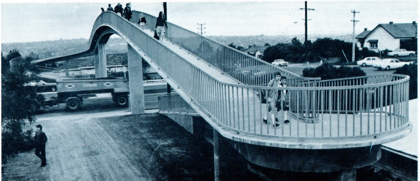
Pedestrian overpass of Manningham Road, Lower Templestowe.

It is important to remember that these conclusions result from the study of a relatively small sample of crossings and therefore cannot be applied in general to all crossings or to any individual site. Adults should appreciate the greater safety which results from using grade separated pedestrian crossings and should encourage all pedestrians to use such crossings.