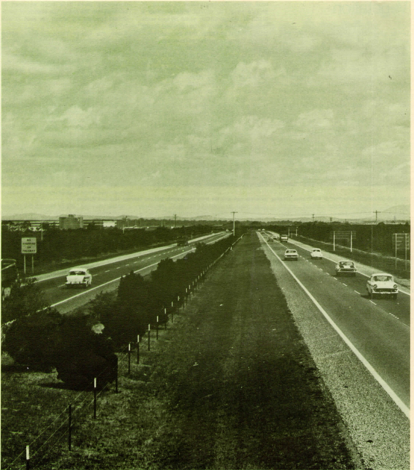
Trees and shrubs have been used on this section of the Tullamarine Freeway to add interest and to provide a screen between the freeway and adjacent land.

life will abound along the line of the new freeway.