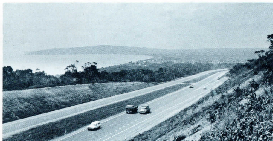
The Mornington Peninsula Freeway — one of the major C.R.B. projects which will be continued in 1973/74.

The grant was made each year to the Board to compensate for the situation which applied up to 1964 whereby the Board received the revenue from fines imposed under the provisions of the Motor Car Act. Since 1964 such fines have been paid into Consolidated Revenue.