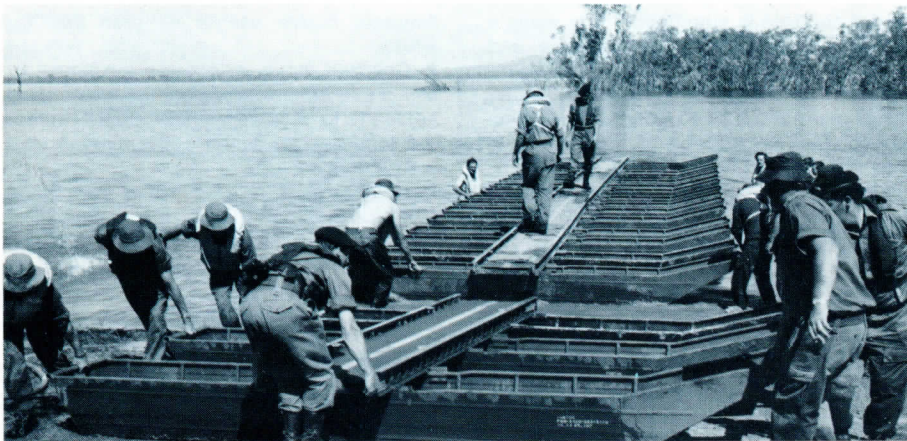
Members of 22 Construction Regiment engaged in a pontoon bridging exercise.