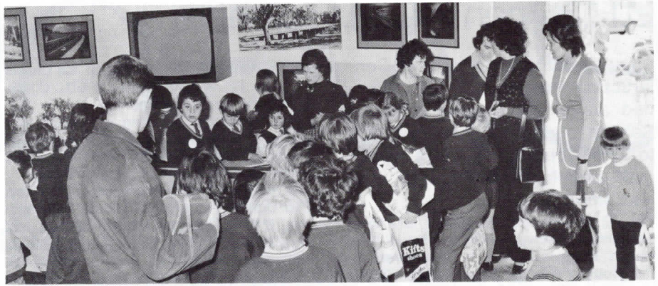
A group of school children find much of interest to see and take some of the many pamphlets available.

The display also included a practical demonstration of the modern scientific techniques employed in testing and measuring the skid-resistance of road surfaces.