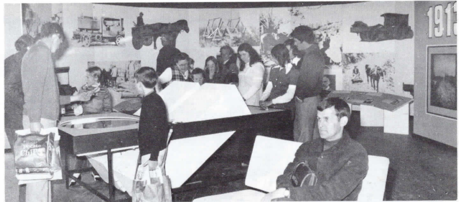
View of one half of the C.R.B. display at the Royal Show.